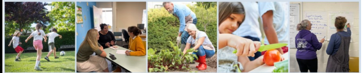
SEA Change is a community driven movement supporting healthy eating and active living through social connection